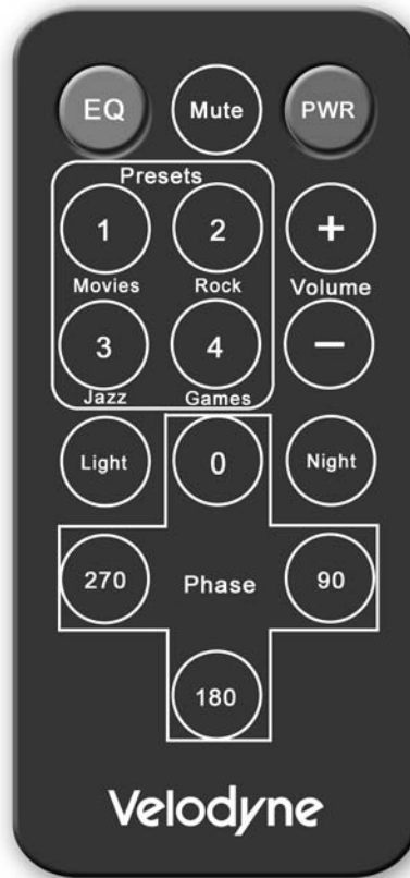
Figure 3. Remote Control

NOTE: The Optimum remote can be attached magnetically to the back of the subwoofer in the upper left hand corner.